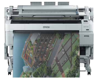
SC-T7200 / SC-T7200D 44" (shown with optional scanner)