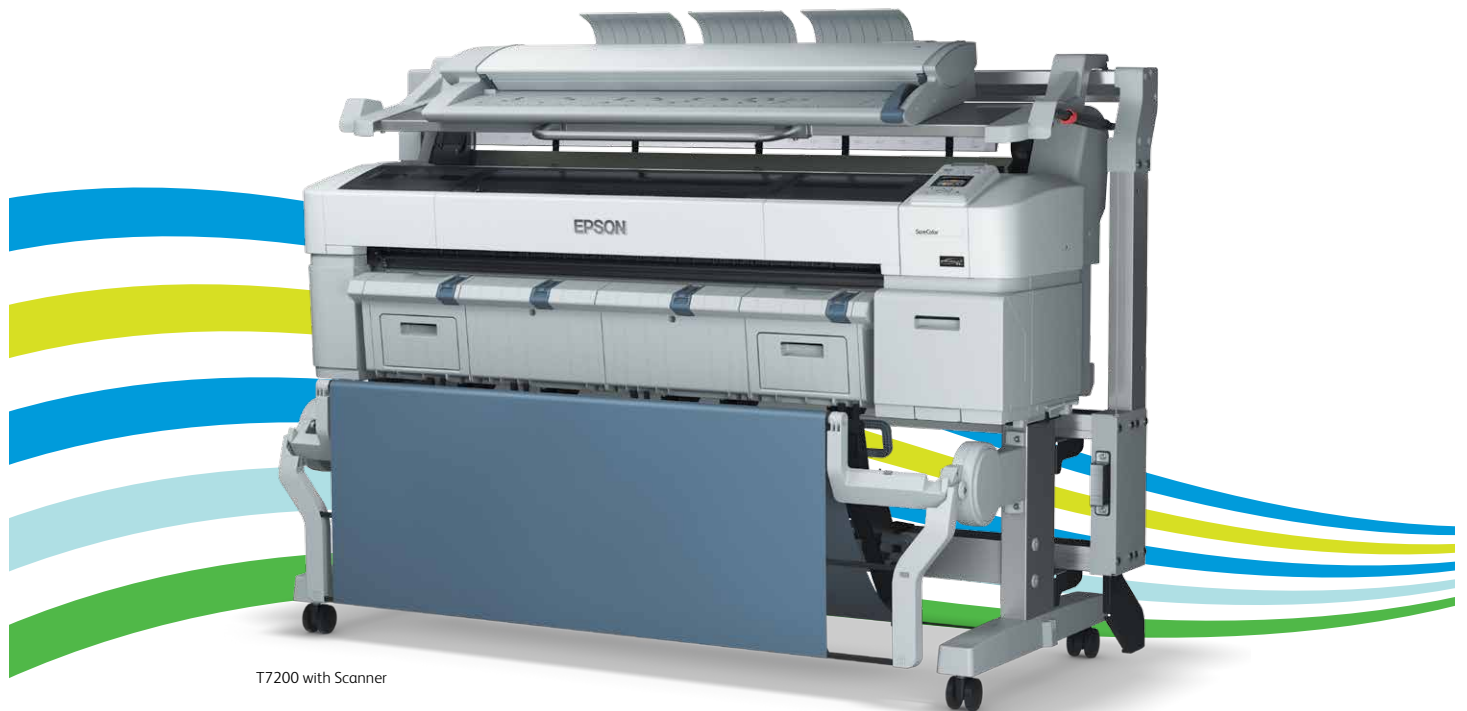
T7200 with Scanner

SC – T7200/SC – T7200D (44") (shown with optional scanner)